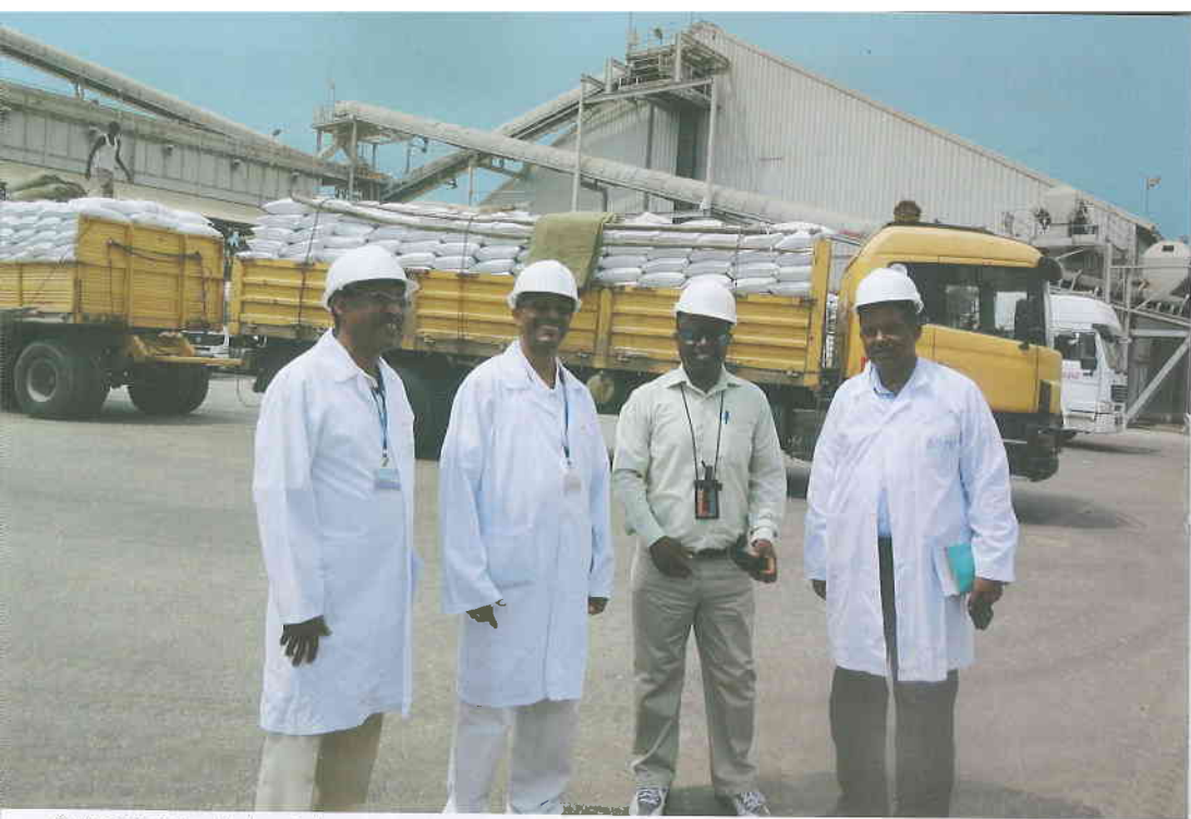
Our guests visiting the terminal