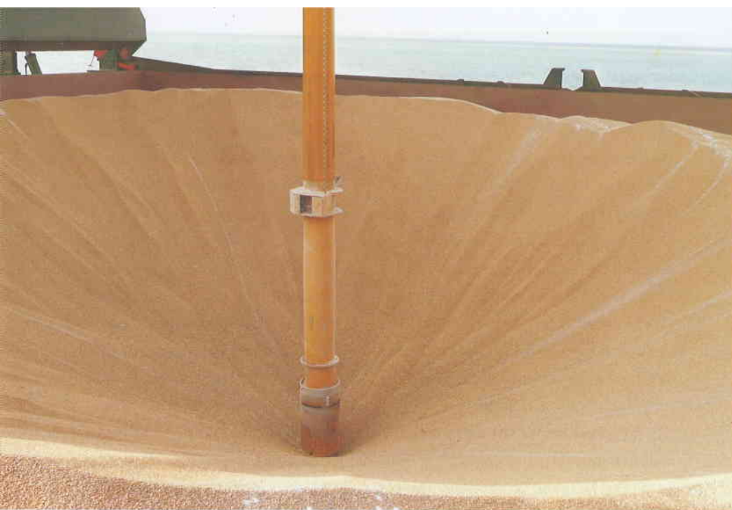
Grain under discharge