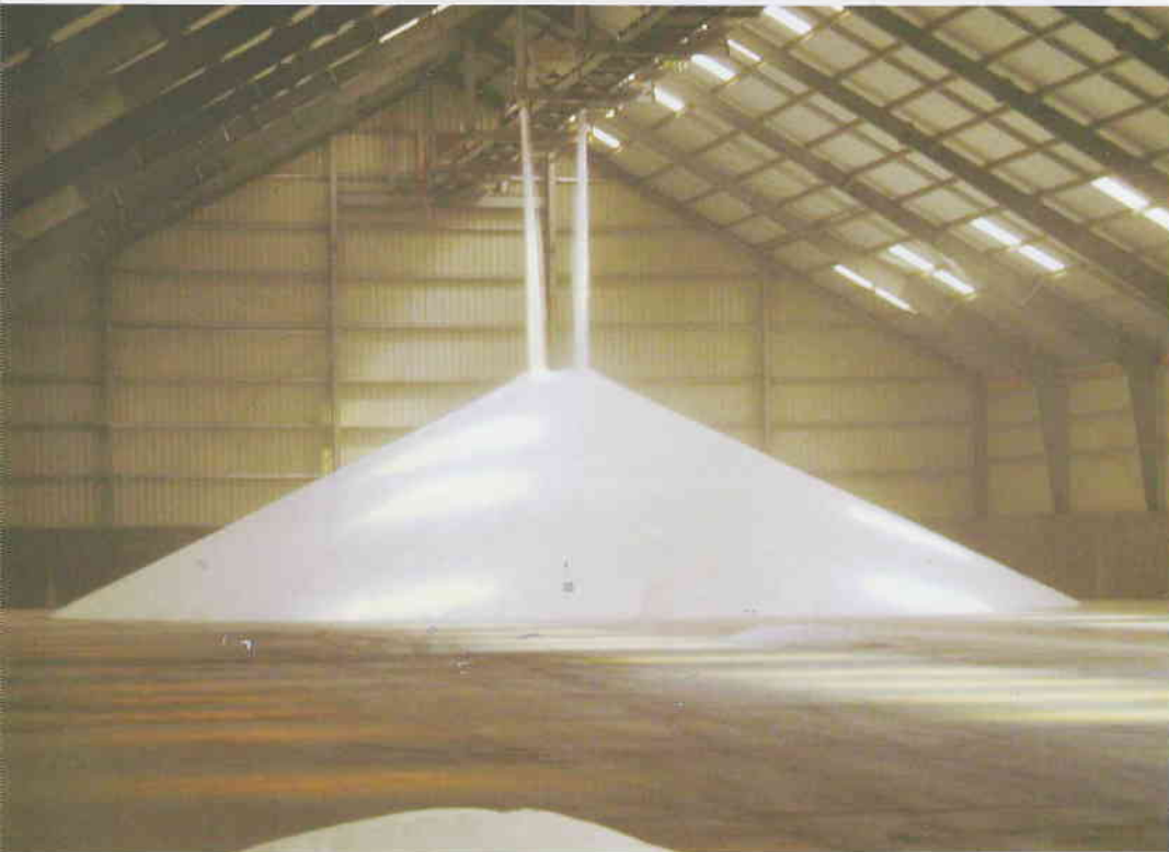
Fertilizer cargo discharged into the silo